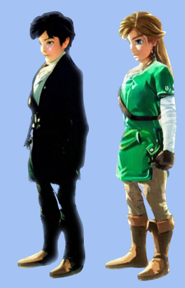
Irkae and Amner