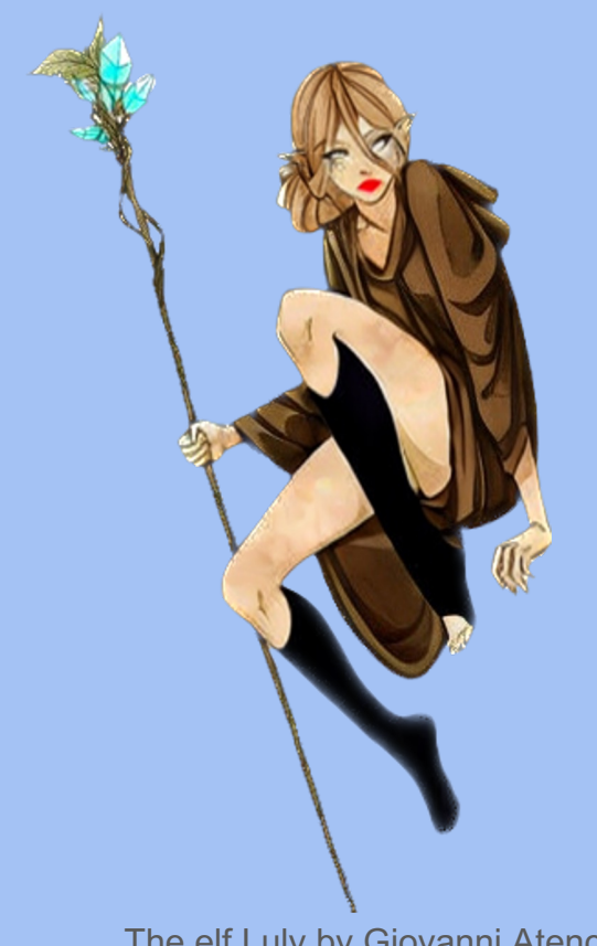
The elf Luly by Giovanni Atencio

They live in a magic island surrounded by the sea, in the terrestrial subsoil, where all the scientist expected only rocks, magmas and death. Its name is Wonderland.